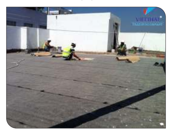
Applying self-adhesive membrane